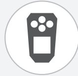
ALTAIR io 4