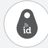
MSA id Tag